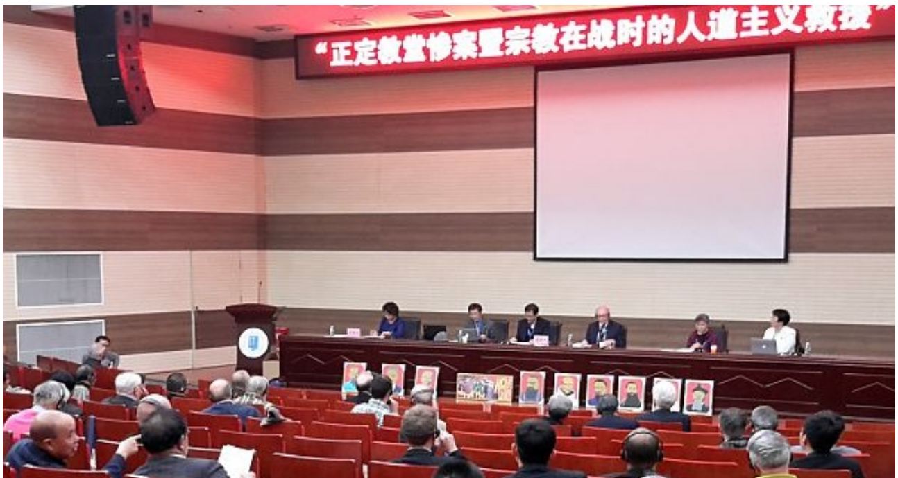
At the end of the conference, 'the international friends, who gave their lives to protect Chinese citizens', are praised once again. The meeting was a great success. The conclusion was an excellent Chinese dinner, which was eaten together.

A report of the conference in 7 pages can be had when ordered via the Mgr. Schraven Foundation