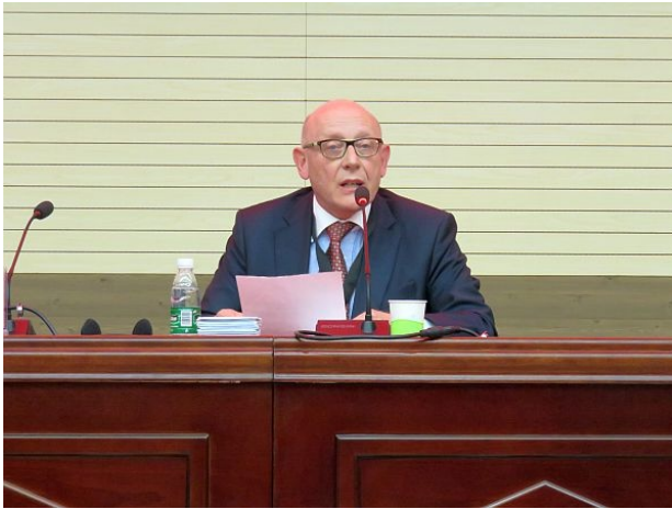
The chairman of the Mgr. Schraven foundation spoke to the audience.