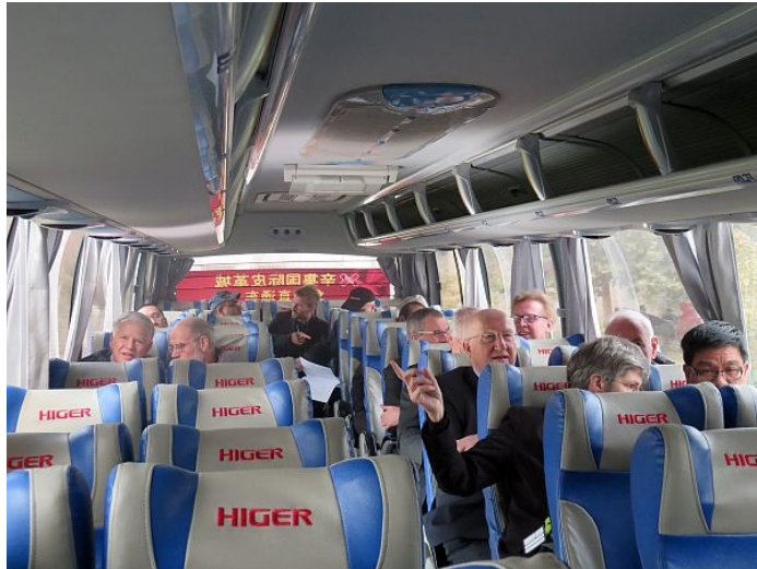
In the bus on our way to...