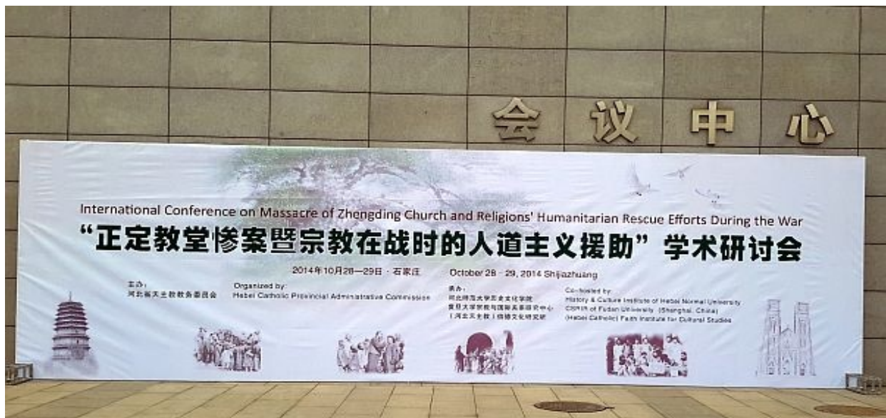
Picture of the enormous banner outside the conference building of the 'Hebei Normal University'