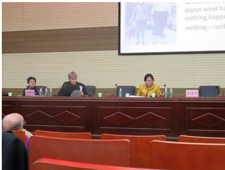
You can say 'a conspiracy of silence' around this massacre