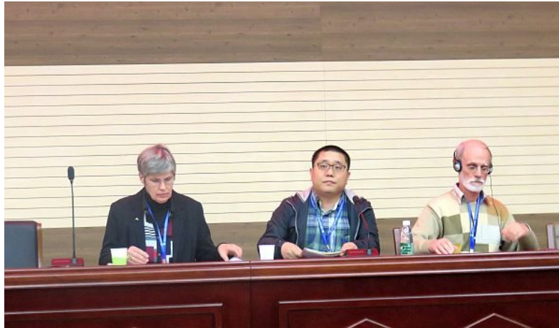
Dutch contributions: 'The Great Silence' and 'mysterious haze' around the massacre in Zhengding