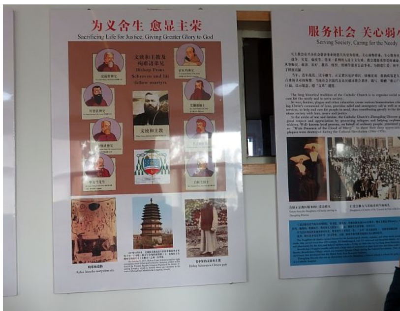
An enlarged page from the comic strip.