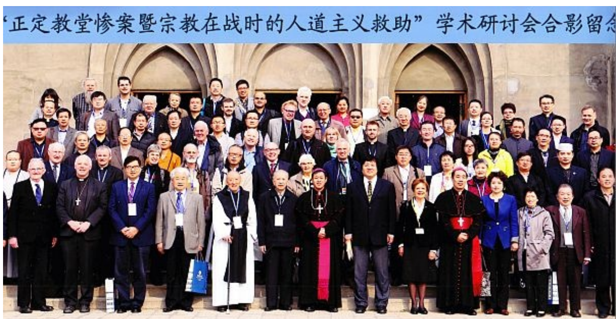
Photograph of the participants at the beginning of the conference, on the stairs of Shijiazhuang's Major Seminary. Were present: 14 Dutch people (1 from Switzerland, 1 from Taiwan, 1 from China); 2 from Slovakia; 1 Austria; 1 Poland; 1 USA; 2 Taiwan; 1 Germany; 3 Indonesian; 1 Belgium; 1 Ireland; 2 Chinese from Hong Kong. The others are from People's Republic of China.