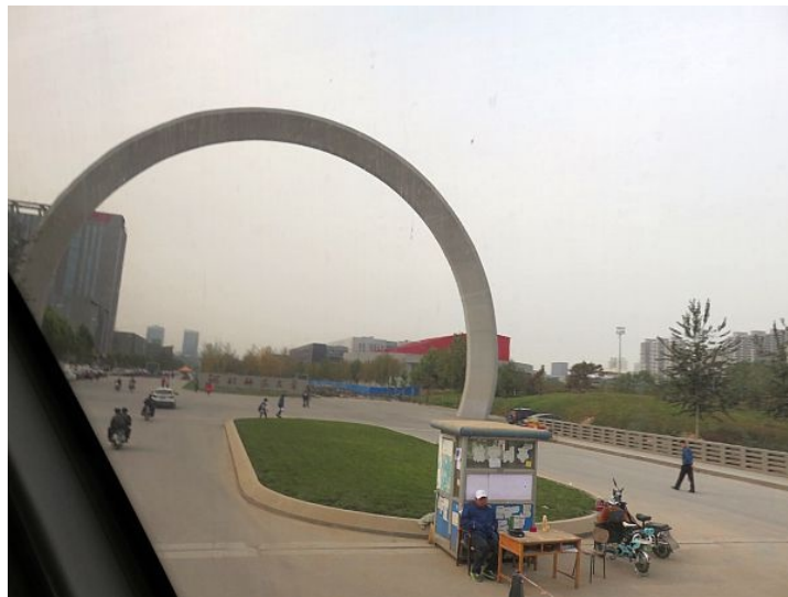
entering the campus of the university