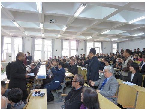
The auditorium. The opening happened here.