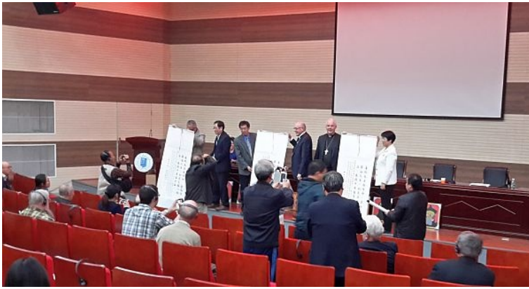
At the end of the conference big banners are presented to the Trappist fathers of Hong Kong, to the Mgr. Schraven foundation to the bishop of Roermond