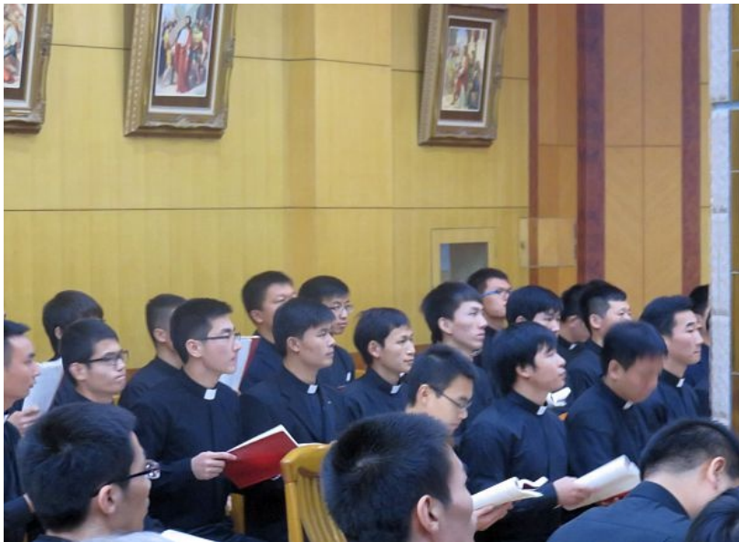
The choir of the students sang very well with much enthusiasm.