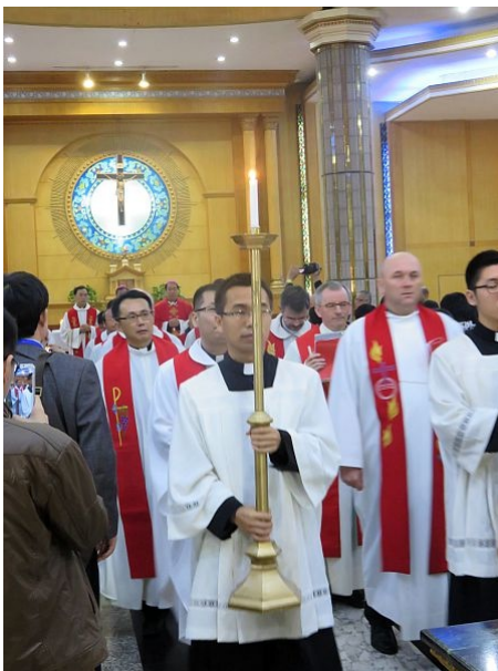
Entering the chapel.