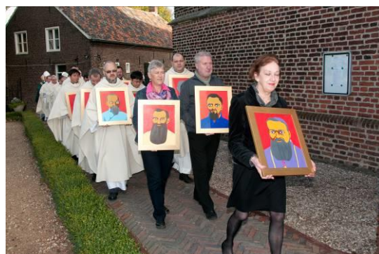
The procession to the church.