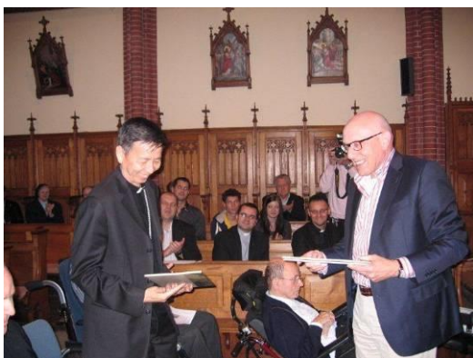
Also a comic book for archbishop Savio Hon.