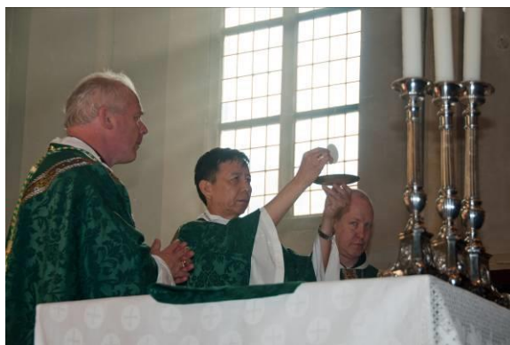
During the Eucharist...