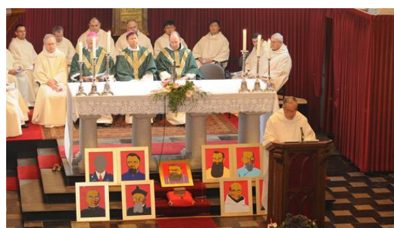
Everyone listen to the apology, some with tears in their eyes. It was followed with an spontaneous applause.