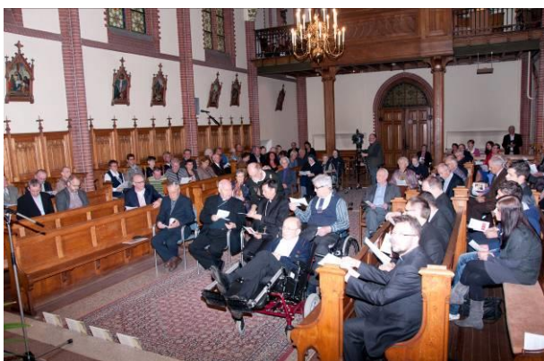
The audience follows the program with great attention.