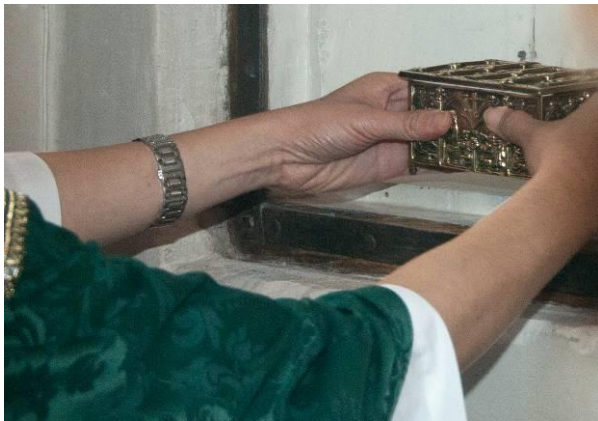
After 75 years the ashes of the martyrs have a final resting place.