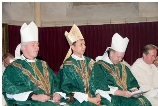
The three men with miters: bishop de Jong of Roermond, archbishop Savio Hon and the abbot Bernardus of Tilburg