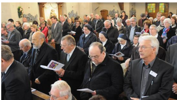
Everyone listened attentively.