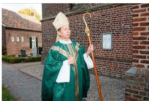
A stately 'patriarch'...