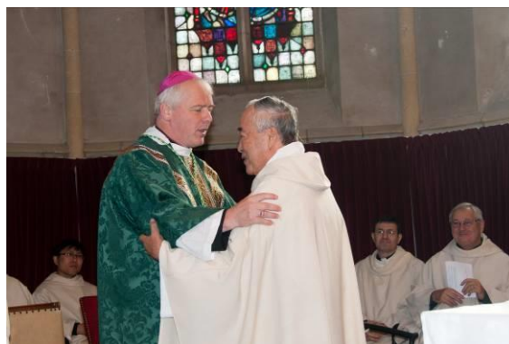
and a gesture of reconciliation followed