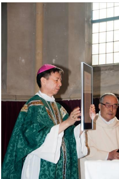
The letter of apology(framed) is accepted